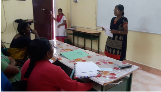
Vocal Solo : (Patriotic / Tamil Folk)