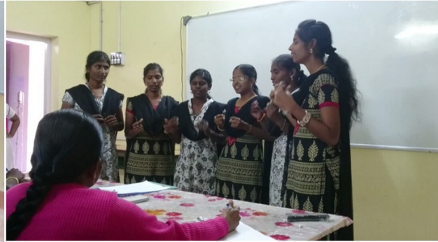
Group Song : (Patriotic / Tamil Folk)