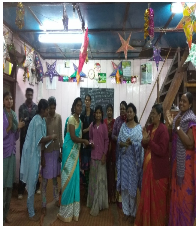
Department of Chemistry students visit to CMS Home, Naidupuram