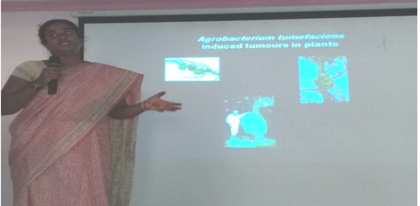
One Day national Seminar on Frontiers in Biotechnology :Challenges and Prospects- organized by the Department of Biotechnology at Mother Teresa Women's University, Kodaikanal.