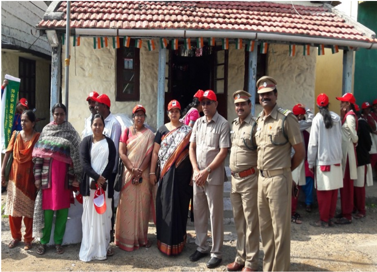
Forest Conservation Rally