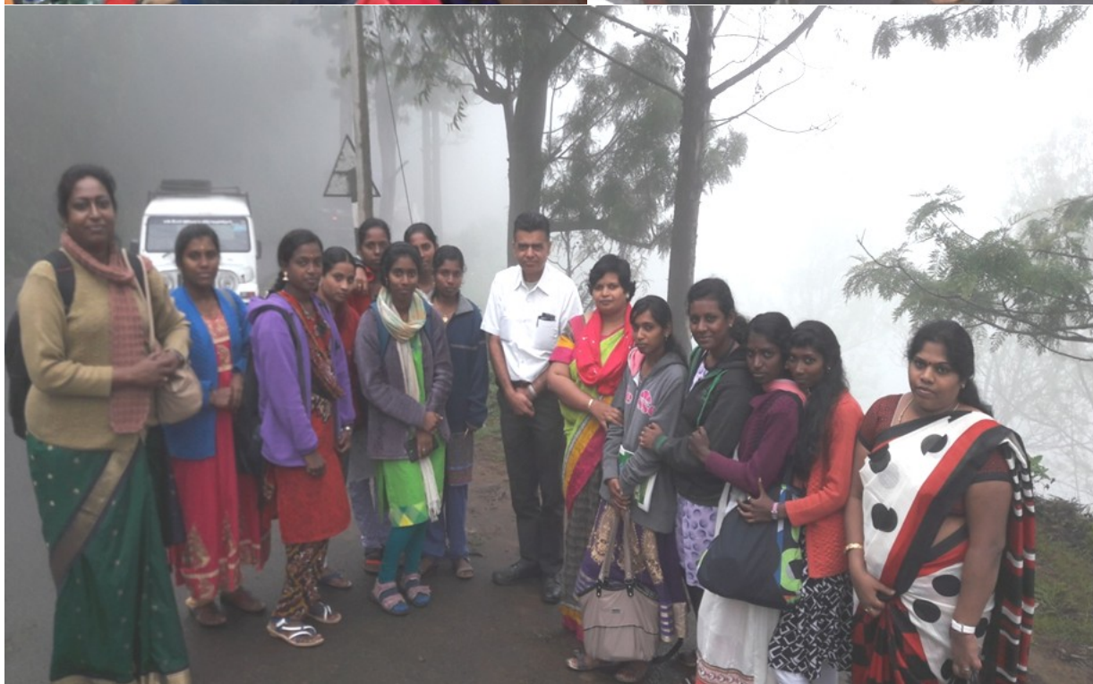
One Day Educational trip to Senbaganur Museum and Pastry Corner Food Processing Unit.