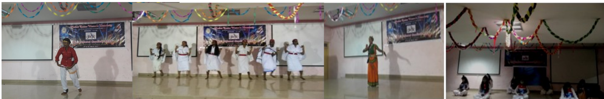
Folk/Tribal /western/classical (Tamil) Dance - Group/ Classical Dance