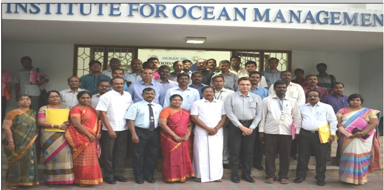
NSS Program Officers Meeting