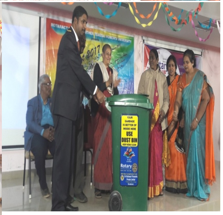
Valedictory Function of ROTA FEST 2K17 and Women Empowerment Programme at Mother Teresa Women's University, Kodaikanal.